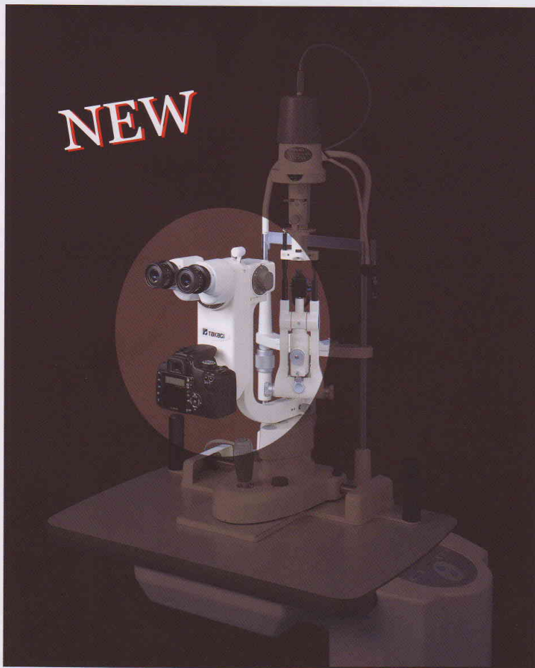
TD-2 does not include a camera.